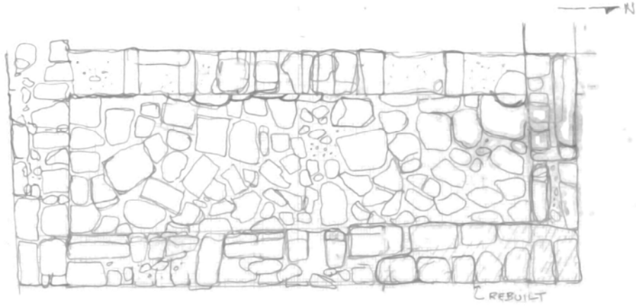
610/69 FLOOR PLAN