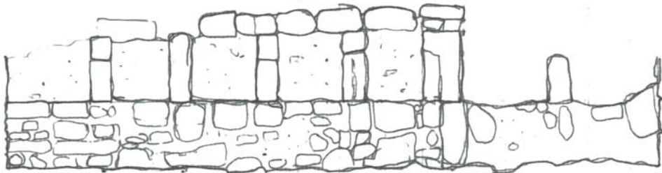
WALL 1926 WEST ELEVATION