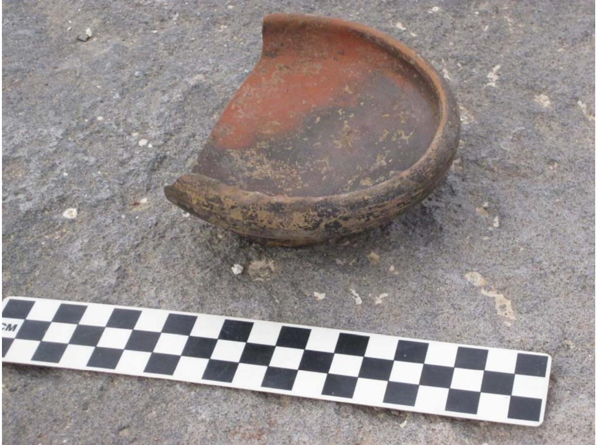
3. Concluded field work for 2014